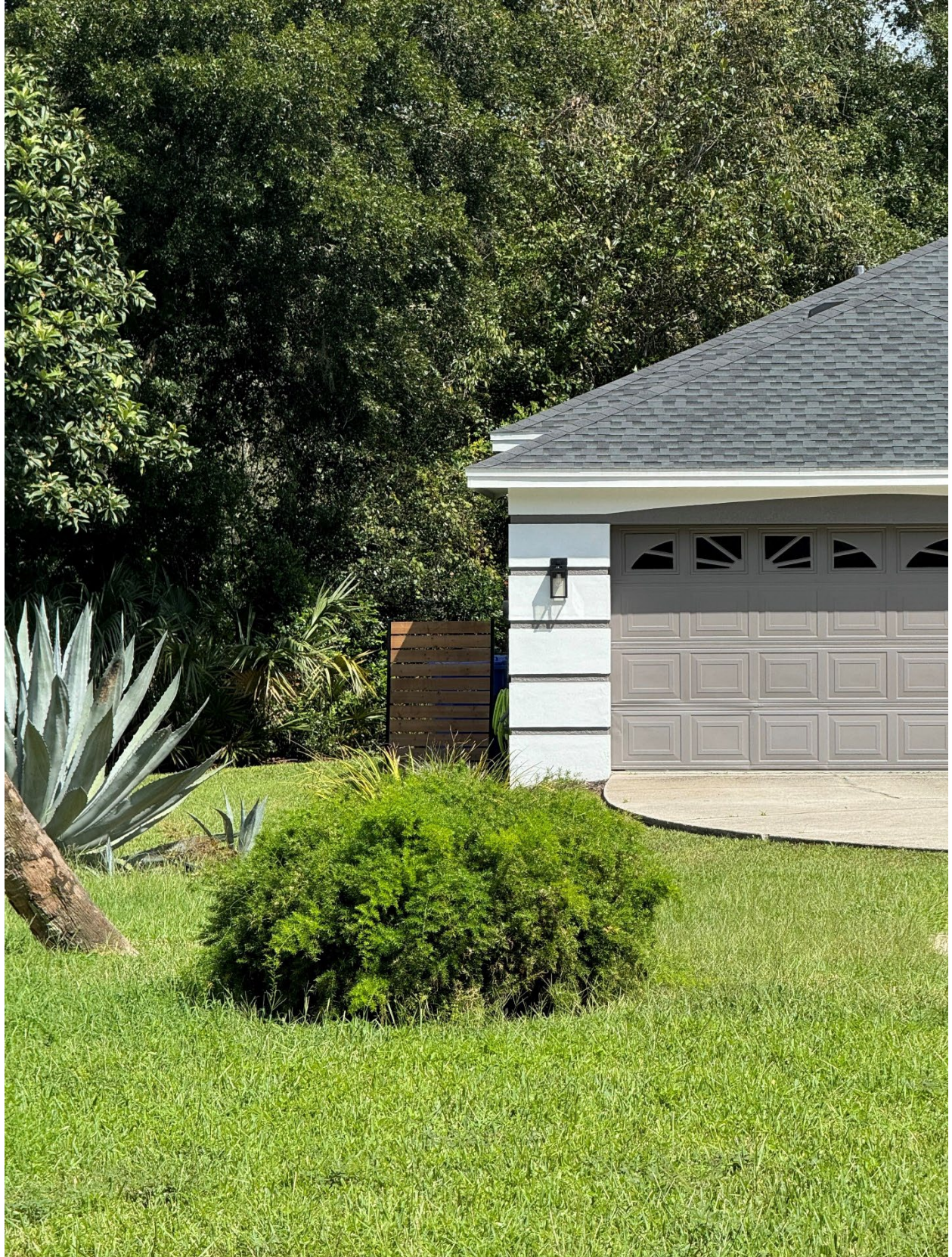
Garbage can screen for 524 Kelly Green Street