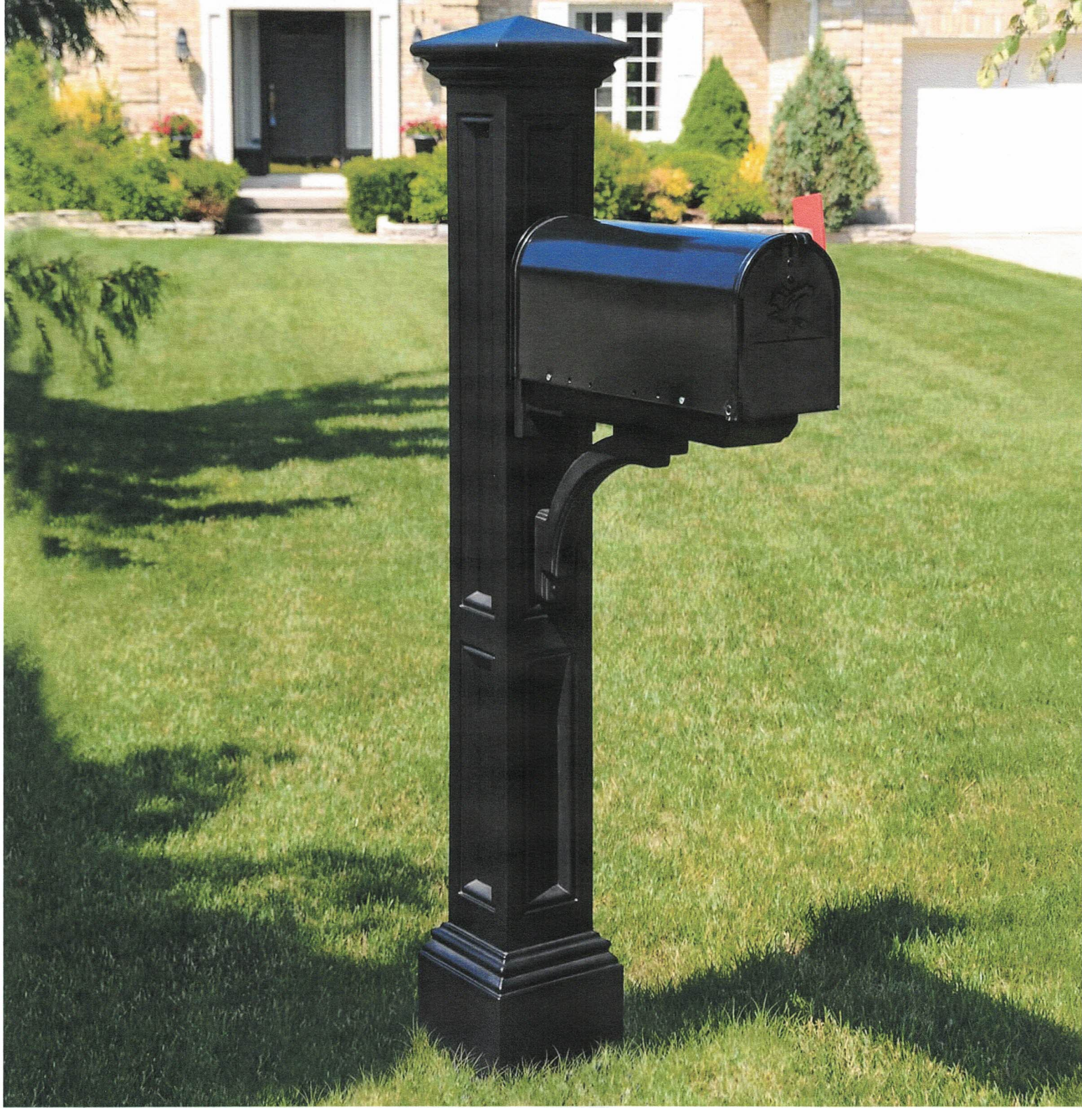
Mailbox and post for 678 Kelly Green Street